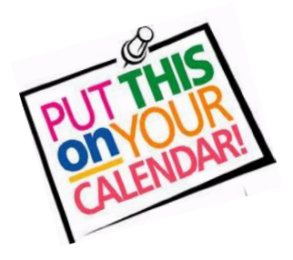
<u>Lochdale Community School Association</u> lochdalecommunityschool.growingsmilesfundraising.com

Thank you for your to share with your friends and colleagues!